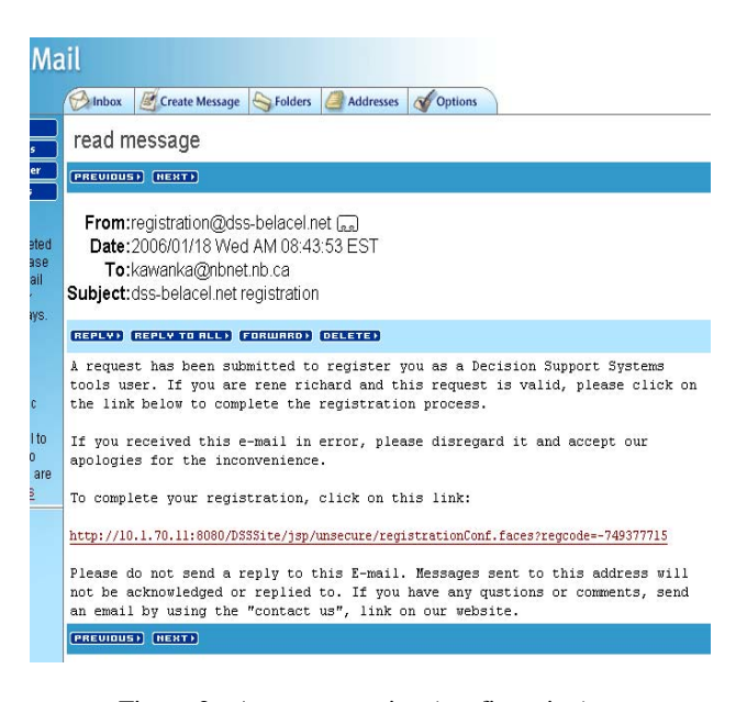
Figure 2 - Account creation (confirmation)

If the registration data is valid, the user is sent an e-mail with a unique link to confirm the account creation (see Figure 2).